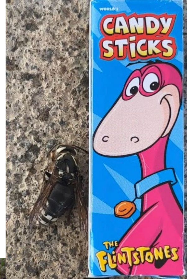
Object for scale?