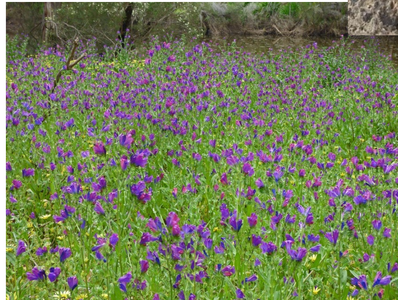
Paterson's curse Echium plantagineum