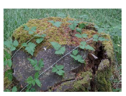
R. ursinus (native)